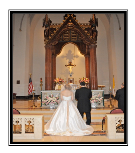
Saint Pope John Paul II

"Marriage is an act of will that signifies and involves a mutual gift, which unites the spouses and binds them to their eventual souls, with whom they make up a sole family – a domestic Church."