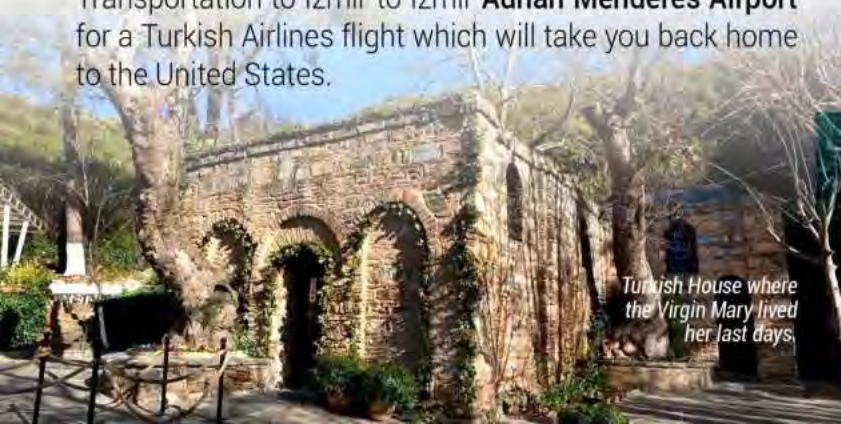
Turkish House where the Virgin Mary lived her last days.