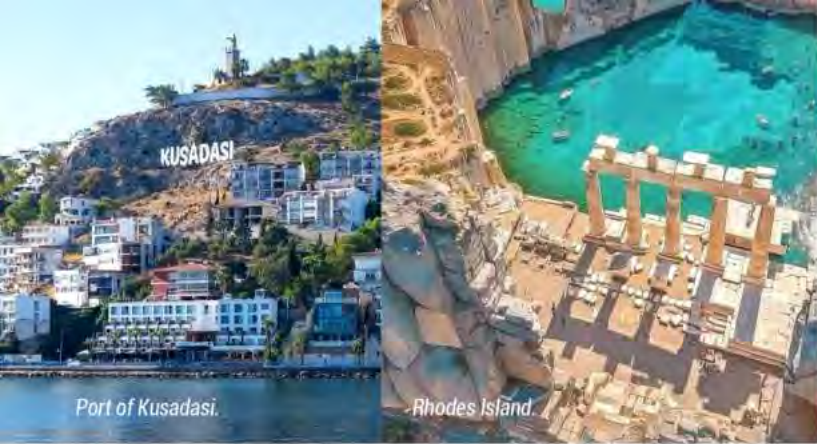
Port of Kusadasi.