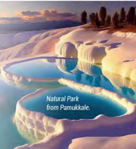
Natural Park from Pamukkale.

Breakfast at your hotel and day trip to Pamukkale . Along the way you will stop by the town of Sultanhanı to visit the Sultan Han, a 13 th century medieval Seljuk caravanserai (roadside inn). Arrival in Pamukkale with free time at the "Cotton Castle", unique in the world with white travertine terraces and calcite-laden waters from the hot springs. Dinner and accommodation.